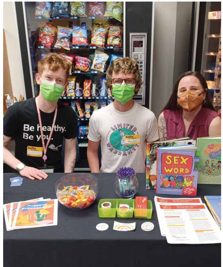
Family Tree Clinic staff at the first-ever Minneapolis Public Schools Gender Resource Fair

supportive for LGBTQ students, families, teachers, and staff. During the Gender Resource Fair, Family Tree staff spoke to parents about gender inclusive and age-appropriate sex education. We also recommended books and shared information about our hormone care program. It was an excellent opportunity to connect with community members and share supportive resources for families.