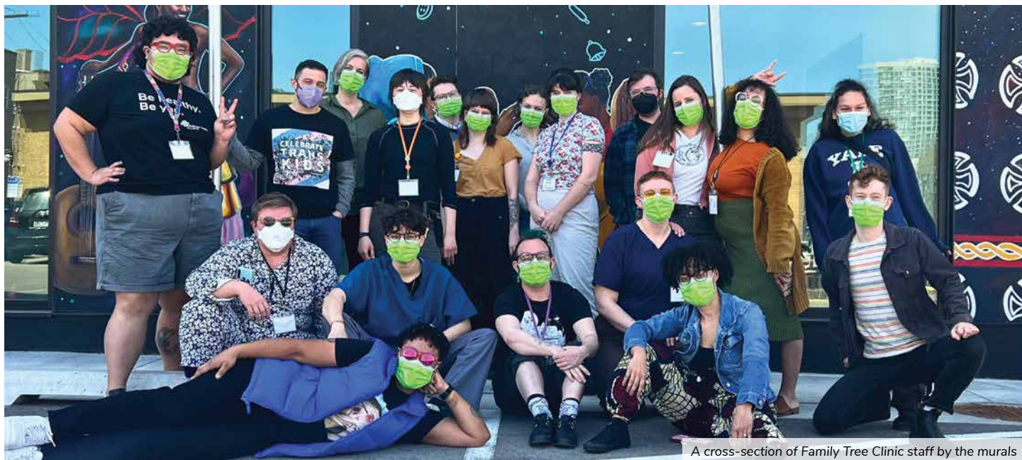
A cross-section of Family Tree Clinic staff by the murals